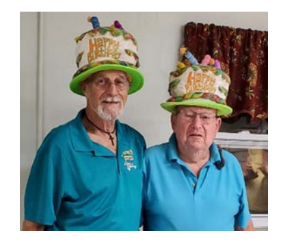
AI & Nell