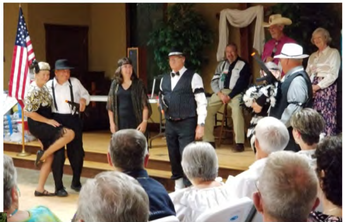
"Roaring into the 20's" 2020 NSDCA Camporee Lebanon, Tenn.