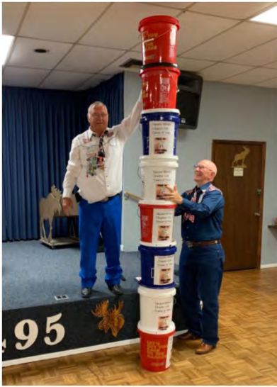
Tower of Tabs