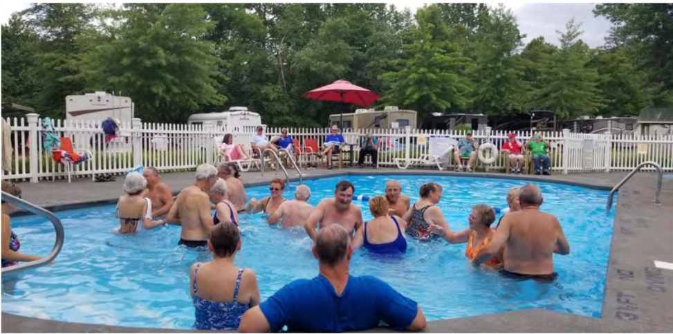
NSDCA Board - Square Dancing in the pool