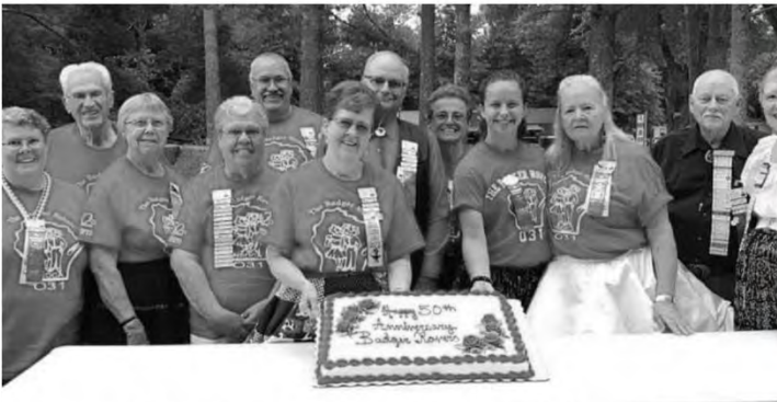
Chapter 031 celebrating 50 years!